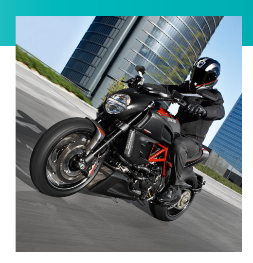
The visualization capabilities of NX will soon replace photography in Ducati's motorbike manuals.