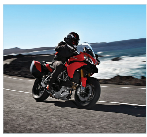
Over the past decade, motorbikes have incorporated more electronics and software, bringing product configuration handling requirements similar to those of the auto industry.

In spite of greater product complexity, Ducati has cut one year off the development cycle for new motorbikes. "Our design and development cycle has been reduced from an average 36 to 40 months to just 24 months, mainly thanks to the tools provided by Siemens Digital Industries Software," says Giusti. "We are also able to update all existing models at annual intervals. It would be unthinkable to achieve such results using conventional design methods."