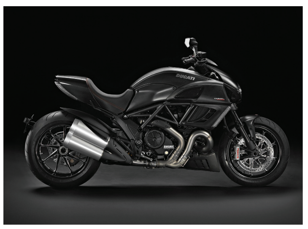
Ducati is a prestigious brand with a strong identity and supported by a wide community of passionate fans.

Of the 1,000 employees who work at Ducati, nearly 200 are involved in research and development (R&D), an area the company supports with large investments every year. The engineering staff includes