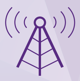
3 of the top 4 U.S. wireless providers

Our mission is to help you build secure, high-quality software faster for years to come.